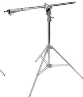
Boom arm stand