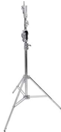
Standard light stand