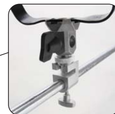
With Lighting Fixture