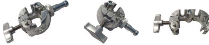
KCP-950P 4 Way Clamp for 35mm to 50mm tube

Four way clamp is constructed of aluminum dia-casting which is very lightweight and durable. The unique spring locking device makes locking just a snap and easy. The equipped P.U. pad also reduces surface damage and enhance gripping action. This is for coupling onto any tube size from 35mm to 50mm such as stands, kupoles, or scaffolds in vertical or horizontal way. The safety loading weight is up to 30KG ( 66 lbs)